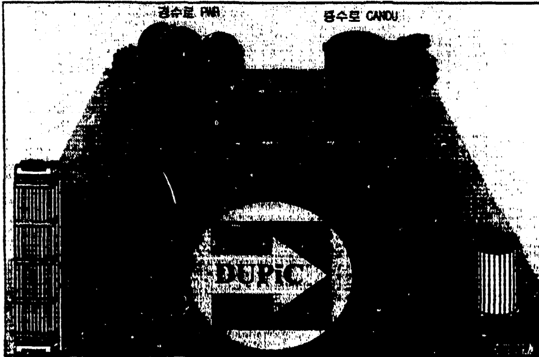
Fig. 2. The diagram illustrates the fuel flow in the DUPIC process from the PWR spent fuel assemblies, through the mechanical refabrication process, to the CANDU fuel bundles containing the highly radioactive fuel.